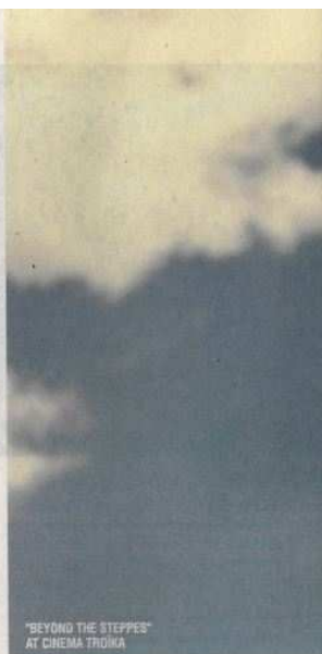
"BEYOND THE STEPPES" AT CINEMA TROÏKA

On the menu? Eight films. Sílvio Tendler, the festival's curator, is presenting Utopia e Barbárie , a documentary that reflects back on the resistance movements, the struggles for independence, and Latin American dictatorships during the second